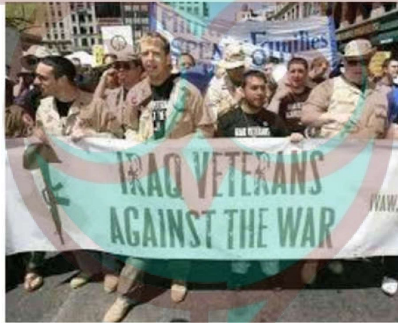
Iraqis protesting against the US invasion of Iraq

Therefore, we see democratic countries taking undemocratic decisions when it suits their own interests